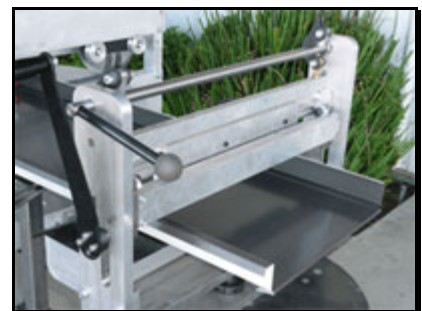
Pic 3. Close up of Swenson Hemmer attachment.

The Snap Table Shuttle can be used as a stand-alone panel processing station or in conjunction with a portable rollformer. The Snap Table Shuttle has a remote interface kit as an option for Newtech rollformers. The operator who stands in front of the Snap Table calls for each new panel by pressing a button on the end of a cord that connects to the rollformer controller. Please enquire if the interface kit is available for other brands of rollformer.