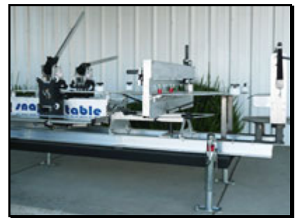
Pic 2. Swenson Snap Table 7000 Shuttle mounted at exit of roll former.